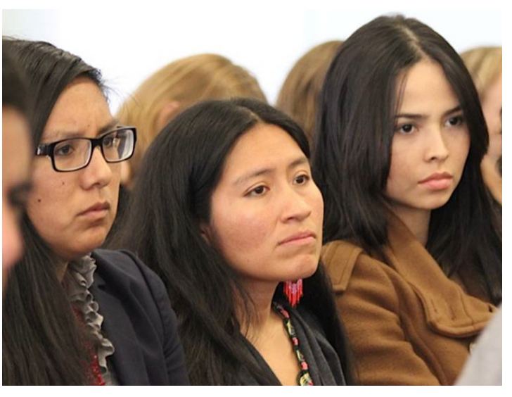
One in three Native women in the U.S. will be raped in her lifetime.

In 2011, the Center, along with several Native women's organizations, successfully petitioned the Inter-American Commission on Human Rights to hold the first ever thematic hearing on violence against Native women in the United States. The hearing focused international attention on the United States' international human rights obligation to respond to the epidemic of violence against Native women.