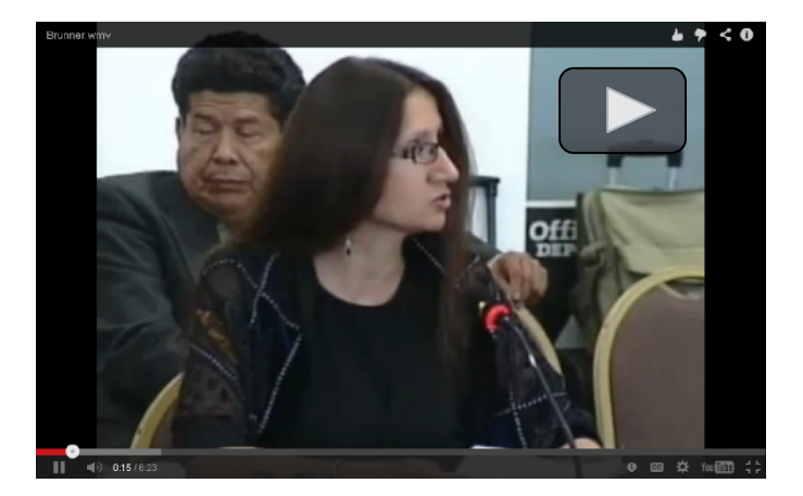
The Devastating Impact of Public Law 280 on the Safety of Native Women and the Development of Tribal Justice Systems

Executive Director, Sacred Spirits First Nation Coalition